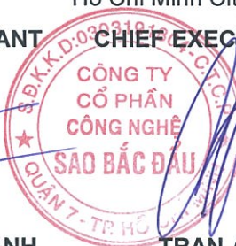
TRAN ANH TUAN