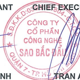
TRAN ANH TUAN