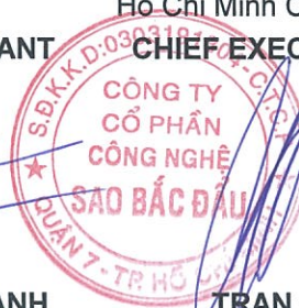
TRAN ANH TUAN